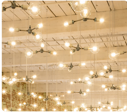
Building 8, 2nd floor