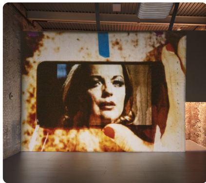
Building 4, 2nd floor