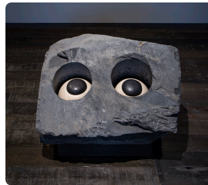
Building 6, 2nd floor