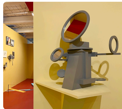
Building 6, 3rd floor