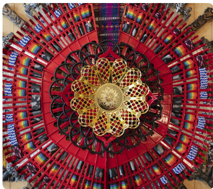
Kidspace, Building 10, 2nd floor