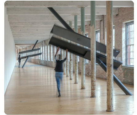
Building 6, 2nd floor