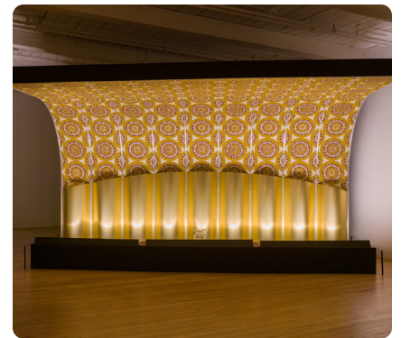
Building 6, 3rd floor