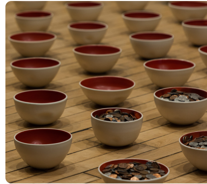
Building 6, 2nd floor