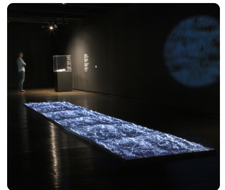
Building 6, 3rd floor