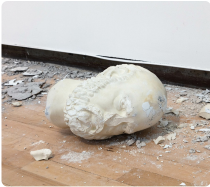
Building 4, 1st floor