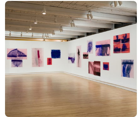
JASON MORAN Building 6, 3rd floor