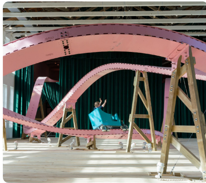
EJ HILL Building 5