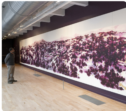
GAMALIEL RODRÍGUEZ Building 11, 1st floor