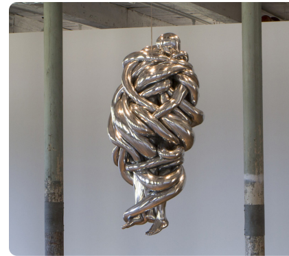
LOUISE BOURGEOIS Building 6, 2nd floor