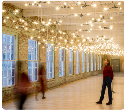
SPENCER FINCH Building 8, 2nd floor