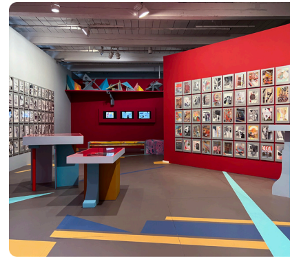
AMY YOES Building 6, 3rd floor