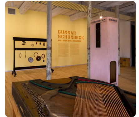
GUNNAR SCHONBECK Building 6, 3rd floor