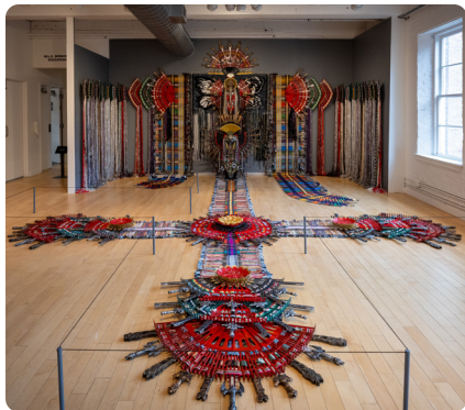
ANNE SAMAT Kidspace, Building 10, 2nd floor