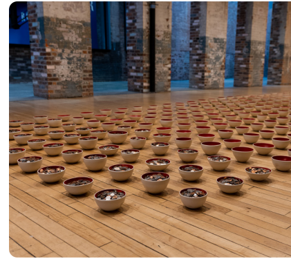
KELLI RAE ADAMS Building 6, 2nd floor