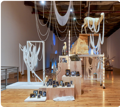
MARC SWANSON Building 4, 2nd floor