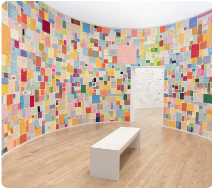
JOSEPH GRIGELY Building 4, 1st floor