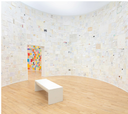
JOSEPH GRIGELY Building 4, 1st floor