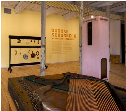
GUNNAR SCHONBECK Building 6, 3rd floor