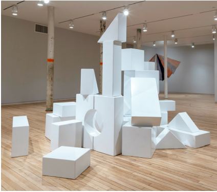
Building 6, 2nd floor