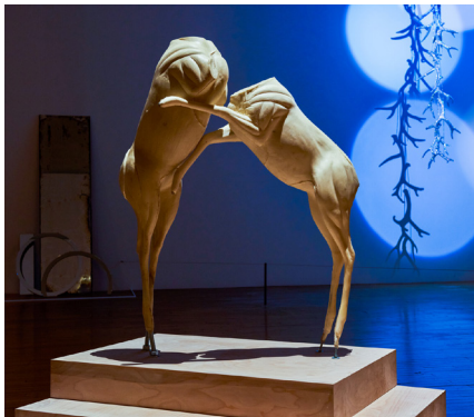
Building 4, 2nd floor