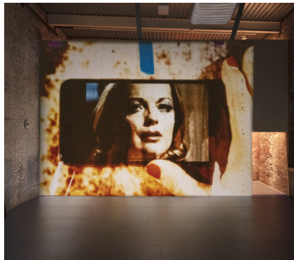
Building 4, 2nd floor