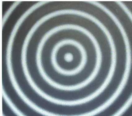
Building 7, 3rd floor