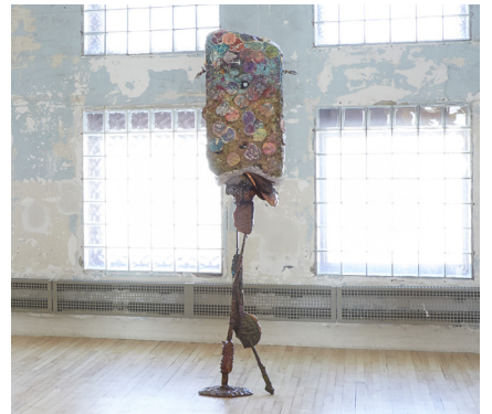
Building 4, 3rd floor