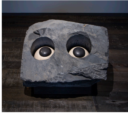
Building 6, 2nd floor