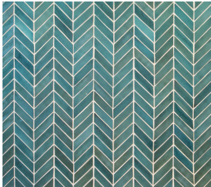
Building 6, 2nd floor