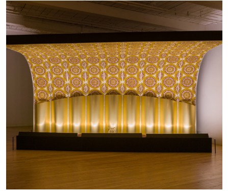
Building 6, 3rd floor