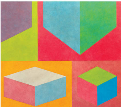
Building 7, 2nd floor