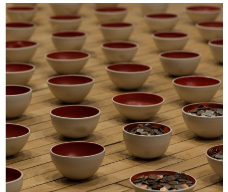
Building 6, 2nd floor