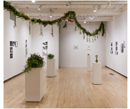
Building 4, 1st floor