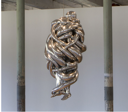
LOUISE BOURGEOIS Building 6, 2nd floor