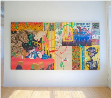
DEFINING MOMENTS Kidspace