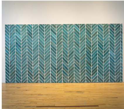
SARAH CROWNER Building 6, 2nd floor