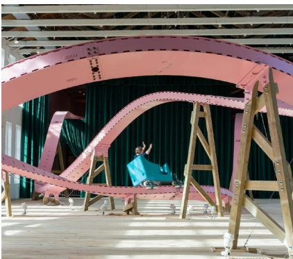
EJ HILL Building 6, 2nd floor