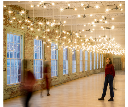
SPENCER FINCH Building 8