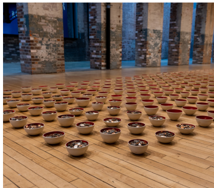
KELLI RAE ADAMS Building 6, 2nd floor