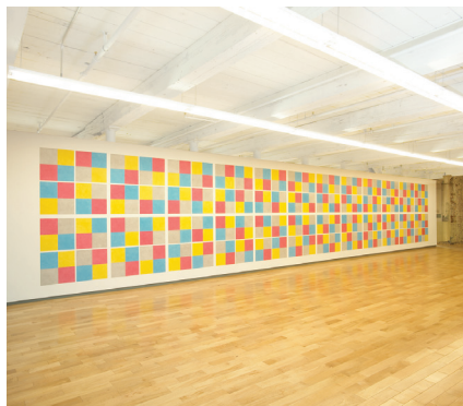
SOL LEWITT Building 7, 2nd floor