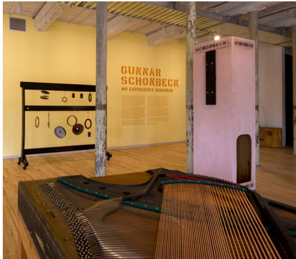
GUNNAR SCHONBECK Building 6, 3rd floor