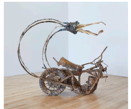
DANIEL GIORDANO Building 4, 3rd floor