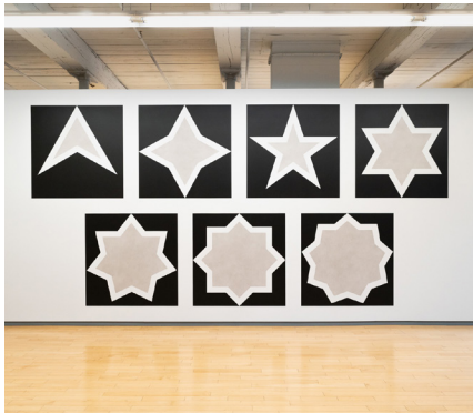
SOL LEWITT Building 7, 2nd floor