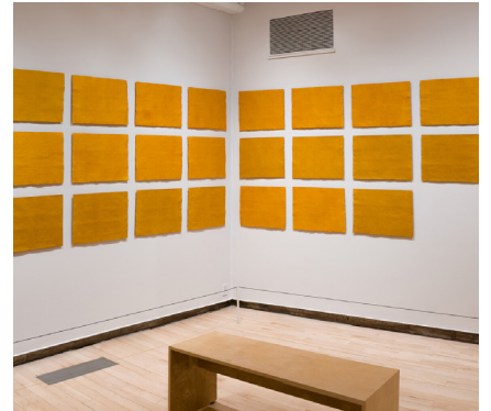
TO SEE ONESELF AT A DISTANCE Building 4, 1st floor