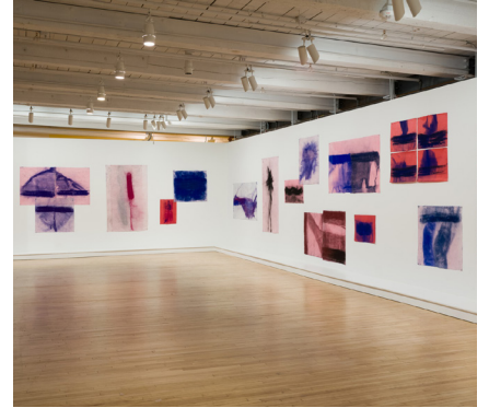
JASON MORAN Building 6, 3rd floor