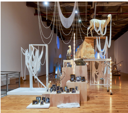
MARC SWANSON Building 4, 2nd floor