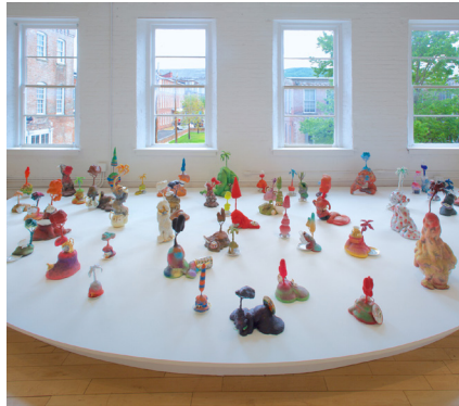
DEFINING MOMENTS Kidspace