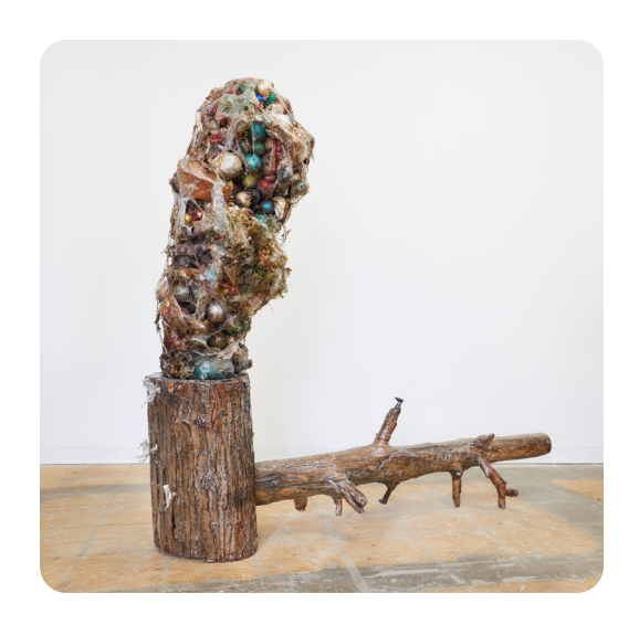
Daniel Giordano, Pleasure Pipe XIII (Jupiter Optimus Maximus) , 2019. Aluminum, artificial clementines, artificial navel orange, Aunt Vicki's cheesecake, buttons, cattails, ceramic, Christmas tree ornaments, construction adhesive, deep fried batter, deer jaw, duct tape, enamel, epoxy, foam ball, gravel, horseshoe, hosiery, mop head, oil based clay, paper plates, phosphorescent acrylic, plastic bags, railroad spikes, steel coat hangers, tennis balls, tin, water chestnuts, wood. 71 x 79 x 24 inches.

rod becomes a mash-up of a weapon and a rustic antenna. The title is a reference to the way he and many boys are too often absolved of their sins.