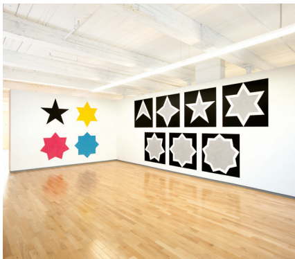
SOL LEWITT Building 7, 2nd floor