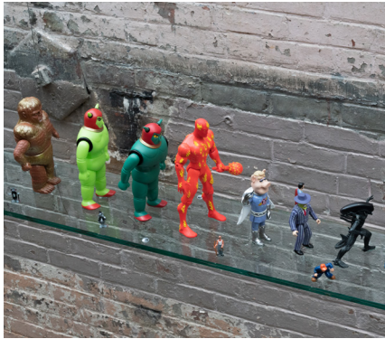
JARVIS ROCKWELL Building 6, 2nd floor