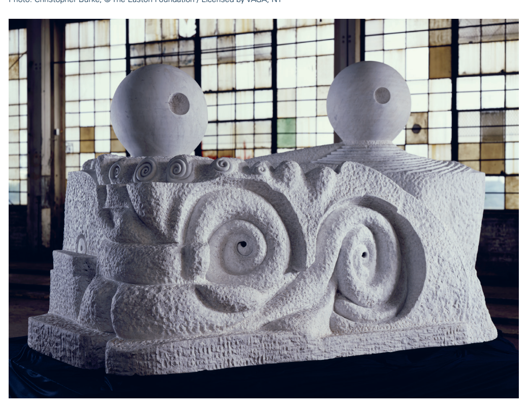
UNTITLED, 1991 – 2000 White marble, two elements; 1st: 73 × 74 × 115 inches; 2nd: 80¾ × 43½ × 100 inches Collection Louise Bourgeois Trust

mirrored imagery recur throughout Bourgeois's practice, and suggest various relationships and couplings—from the self/other to husband/wife, parent/child, mother/father. Together but separate, the two elements in Untitled might seem to suggest the fear of separation and abandonment that Bourgeois indicated is within all her work. Untitled makes its United States debut at MASS MoCA, along with a dramatic history. The sculpture was created from the remains of an earlier related work which was badly battered and damaged beyond repair when it was caught in a terrible storm at sea upon its return to New York from Europe. Bourgeois salvaged the marble and carved the current version of the work. Rather fittingly, the artist once again transformed loss into new sculpture.