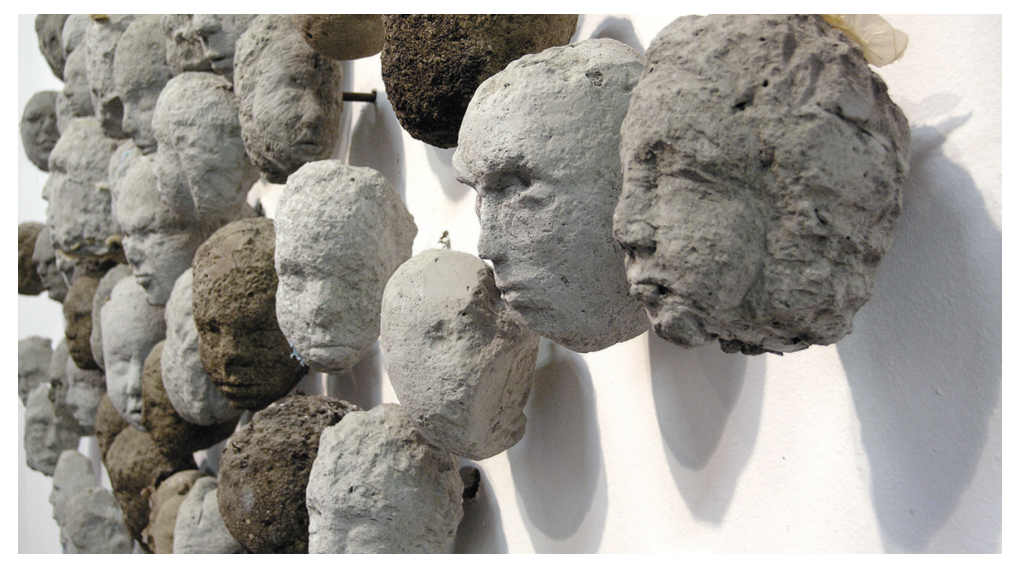
Above, below: Congregation , 2006. Concrete and steel, variable dimensions Collection Pérez Art Museum Miami, gift of Jorge M. and Darlene Pérez

The vulnerability of these heads – despite their size - differs dramatically from the strength articulated in more conventional monuments. which tend to honor the victors rather than victims. Fittingly, Moe has replaced the usual verticality of public statuary, with their elevated pedestals, with horizontally oriented sculptures that sit directly on the ground. Similarly, Moe's enormous work Relief - an awkward animal is an image of struggle, or perhaps, as the title suggests, the relief that comes with submission. Straining on its back, with chest distended and legs splayed, the writhing creature suggests both a dog and a horse, animals which appear frequently in the artist's drawings, often morphing into their human companions. The creature can easily be imagined as a fallen mount, its rider missing. Moe seems to have literally and metaphorically upended the ubiquitous equestrian statue that honors triumphant warriors in countless town squares and plazas across Europe and America. The defenseless animal reminds us of the casualties - and the dynamics of dominance that shore up this narrative of masculine heroism that we so often see immortalized in solid bronze. These themes, which have preoccupied