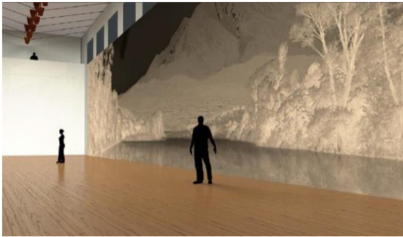
Center Building Installation Concept, 2015

Extreme scale, super high-resolution photography, augmented reality, immersive video, and music probe the junction of nature and abstraction