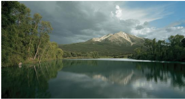
Mountain IV , 2005 Chromogenic color print, 75 x 130"

In the museum’s tallest gallery, for example, Ross’s Harmoniums — small details extracted from the