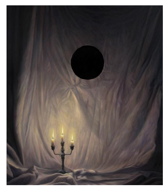
TM Davy, Portrait of Darkness , 2012 Oil on canvas, 59.05 x 51.18 in.

Jeronimo Elespe paints dreamlike scenes based on autobiographical details, lingering between myth and the mundane. The artist's pointillist-like application of paint often evokes the illusion of night, creating atmospheric images that suggest the dark. In Hesperides (2017) the maidens of the evening from Greek mythology emerge like ghosts from a crepuscular mist wearing head scarves and carrying goblets.