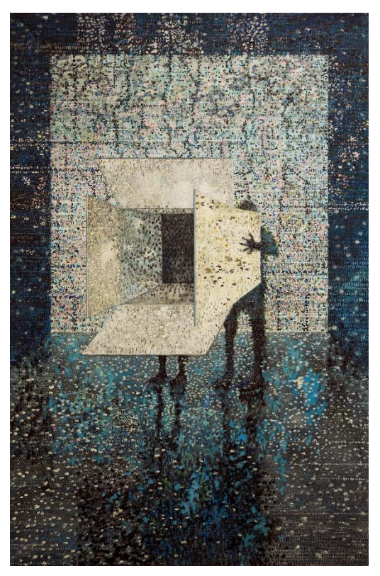
Jeronimo Elespe, Invitaciones peligrosas , 2017 Mixed media on panel, 39 x 25.5 in.

Featuring paintings — including new commissions — by a diverse group of over a dozen contemporary artists