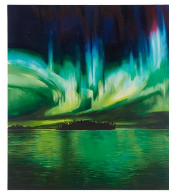
Sam McKinniss, Northern Lights , 2017 Oil and acrylic on canvas. 96 x 84 in.

Showing two new works, including one that measures nearly 15 feet, Cy Gavin often paints the night. Drawn to the darkness when color is difficult to discern, he lets his imagination take over. His fantastic hues — acid greens and fluorescent pinks — are inspired in part by the vivid colors of Bermuda by day: pink hibiscus, green ferns, turquoise water, and the purple iris-like Bermudiana flower. They also impart the intense emotions embedded in the land and the legacies of slavery that linger on the island. For MASS MoCA Gavin painted a monumental image of Bash Bish Falls under ice, paying homage to the landscapes of Caspar David Friedrich.