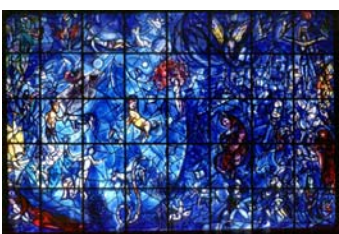
14. Memorial Window by Marc Chagall http://www.peacewindow.org