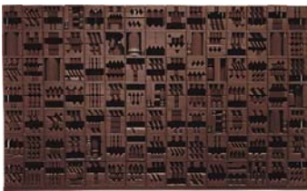
12. Luminous Zag: Night by Louise Nevelson http://www.guggenheim.org