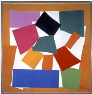
11. L'Escargot (The Snail) by Henri Matisse http://www.tate.org.uk