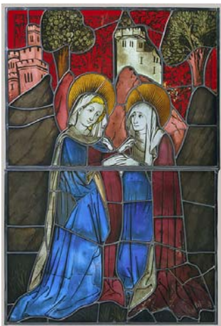
13. The Visitation from the Carmelite Church at Boppard-am-Rhein http://www.metuseum.org