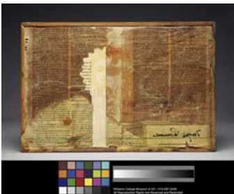
6. Sun Boxy (back) by Joseph Cornell