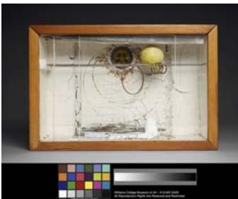
5. Sun Box (front) by Joseph Cornell