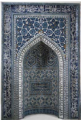
15. Mihrab , Isfahan, Iran